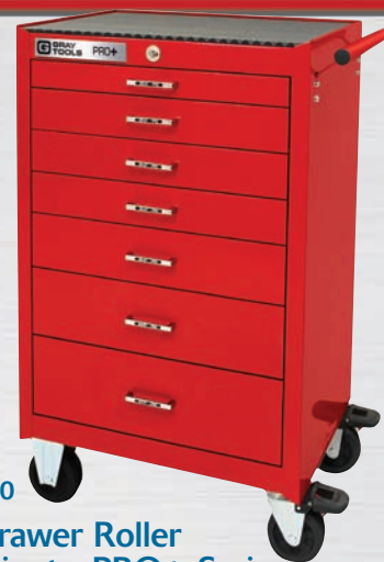
93270 7 Drawer Roller Cabinet - PRO+ Series