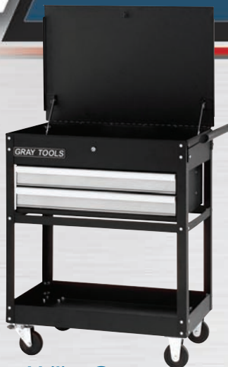
97502B 2 Drawer Utility Cart