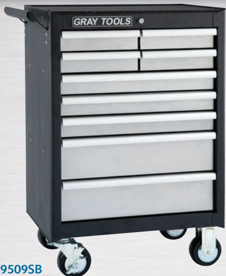
99509SB 9 Drawer Roller Cabinet - Marquis Series